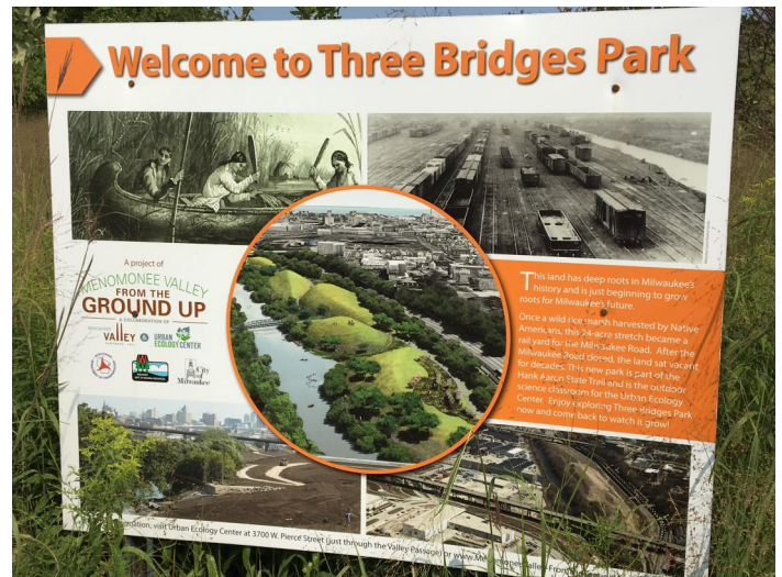
Photos along the trail which follows the Canadian Pacific yards in the Menomonee Valley

The ride was 7 miles long traversing through the Hank Aaron State Trail. We saw the various historical markers of what was once the site of the Milwaukee Road Shops and ended up at the Harley Davidson Motor Restaurant for some evening appetizers. We did get some attention as our bikes were the only ones there that didn't have a motor! Enjoy some pictures of the scenes along our route.