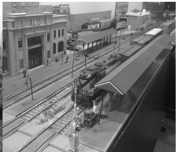
Above: Chuck's layout features a lot of highly detailed scenes, such as this passenger depot.