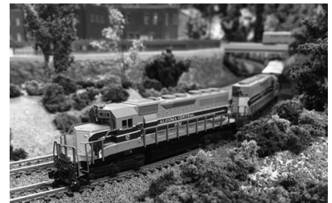
Some pictures of Steve Miazga's N scale layout from the September 20 meet.