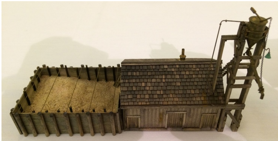
First Place Structures: Dave Evans': Dungannon Sand House