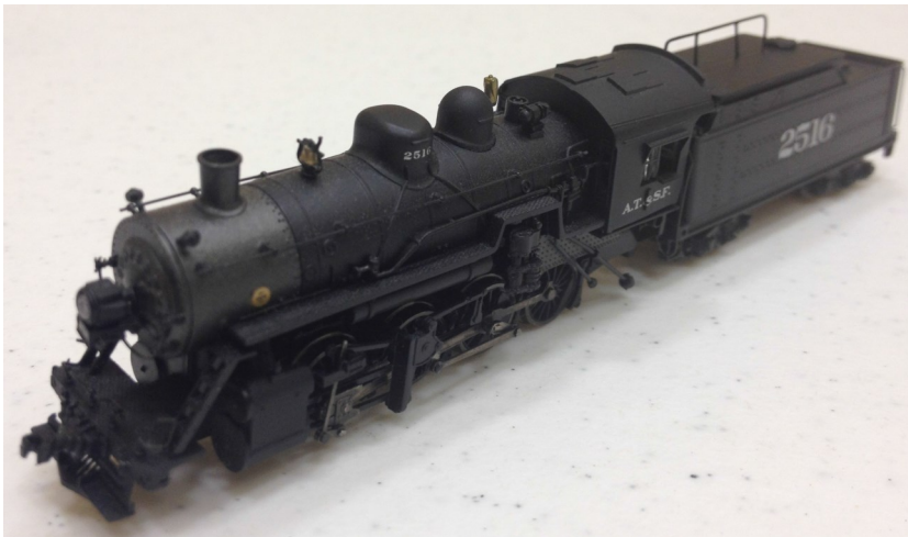
Motive Power – Steam 1 st Place / Jim Rindt (N scale 2-8-0 Santa Fe Steam Locomotive)