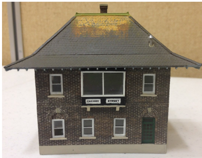
Structures 1 st Place / Jim Rindt (CN Cherry Street Tower in Toronto, Ontario)