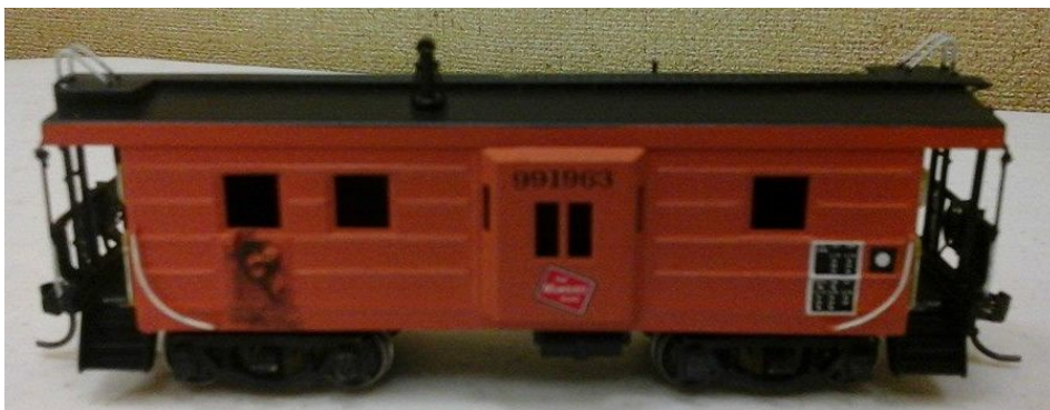
Non-Revenue Equipment – 1 st Place / Mike Slater (Milw. Road Caboose)