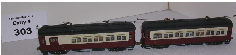
1st. Traction: #303 2 car CA&E Interurban Train by Andy Breaker