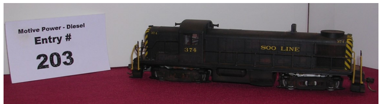
1st. Motive Power Diesel: RS-3 by Neal Michel