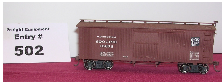
1st. Freight Equipment: SOO Line Reefer by Randy Bingham