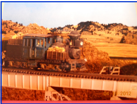
Model Photo 2nd Place Paul Wussow Old #1