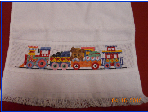
Train Related Crafts 2nd Place Dianne Michel Counted Cross Stitch Train Bib