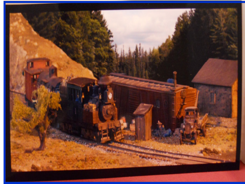
Model Photo 1st Place Paul Wussow Workshed w/Hills