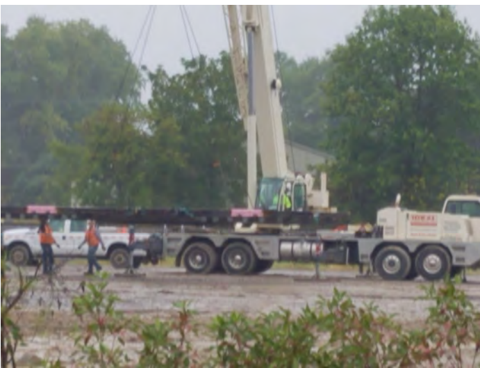
The first of two major track panel shipments is off-loaded from a flatbed semi. This was one of the two large panels that were prefabricated for the diamond replacement. Delivery was early September.