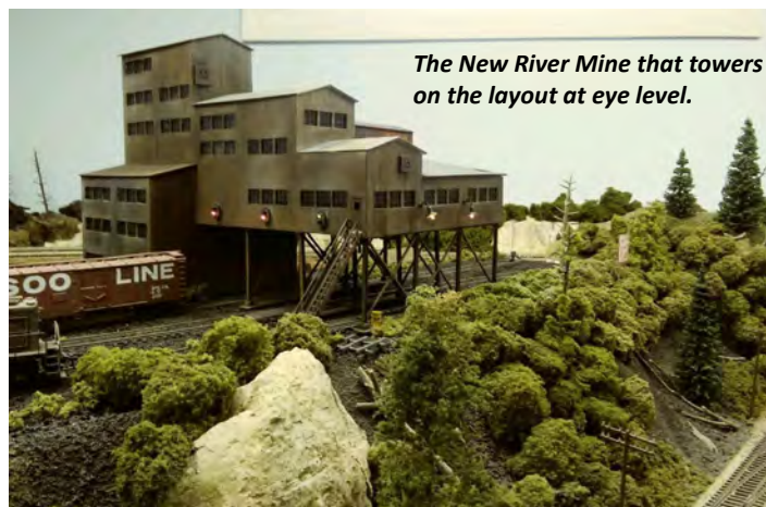
The New River Mine that towers on the layout at eye level.

design. I like switching and recreating a version of the Beer Line that will provide the setting for the action.