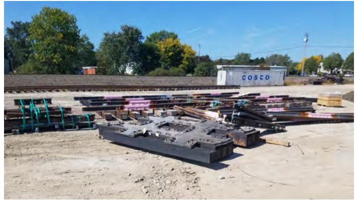
Above, the diamond components have arrived and are ready for final site assembly. Note the heavy plating on the new steel design.

Since our September issue, we have given our members updates on construction activity in and around the Duplainville crossing of the Canadian Pacific and Canadian National in Pewaukee. Early November brought about the closure on a major project that had started in the Summer of 2019. Last August, the CP removed the westbound to northbound switch on their mainline that connected to the interchange track to the CN that had been in place since 1987 at this major crossing. In June of this year, crews from CP removed the balance of the interchange track up to Green Road on the north and the former roadbed was excavated and used to enlarge the maintenance area in the northeast quadrant of the railroad junction.