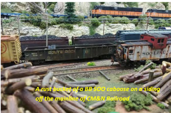
A rust bucket of a BB SOO caboose on a siding off the mainline of CM&N Railroad

The planned layout expansion, by many standards isn't large for a HO layout. The design is leaning towards the finished Milwaukee Beer Line as modeled by the staff of Model Railroader, but be only less half the size of the original Beer Line layout or follow the design of even the Beer Line Extension is possible. The track plan must have an interesting track arrangement to permit the shuffling cars between industries and include some car storage, remembering larger isn't always better in layout