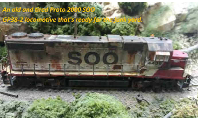
An old and tired Proto 2000 SOO GP38-2 locomotive that's ready for the junk-yard.

A small freight yard and a collection of industries is