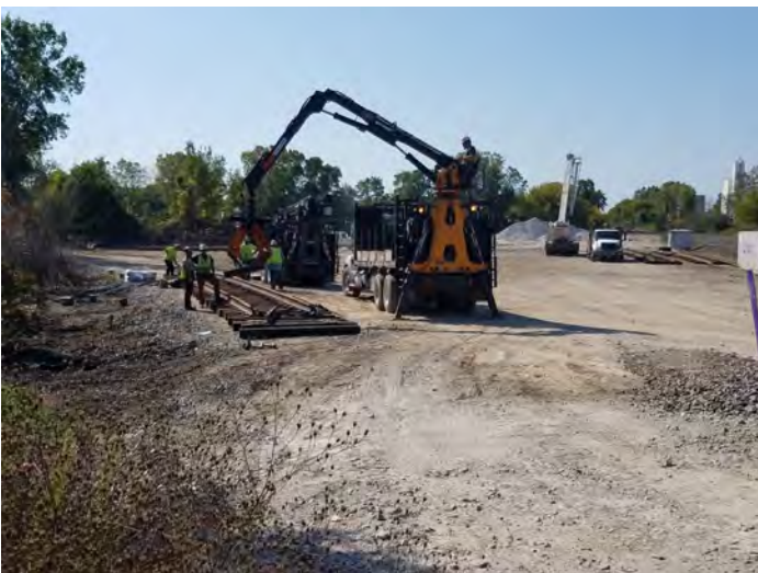
A view of the expanded landscape at the junction. Track panel construction is underway with CN crews in the foreground. This photo was taken in late October 2020.

The overall scope of the construction began to become apparent when new prefabricated “crossing diamonds” began to arrive via flatbed semis in September. The maintenance area began to show the signs of a staging area for a much larger project. Track panels were being assembled by CP and CN. Ballast stock piles began to grow. Construction equipment would come and go. Questions to local crews pointed to an early November conclusion to the project. The core project was the replacement of the twin diamond at the junction and the removal of the remaining interchange track infrastructure, much of which was below ground and controlled the signals and train communication. The evening of November 10 was the planned diamond replacement date, with train traffic to be at a standstill for 12 hours beginning at 7:00 pm. But the heavy activity would start ten days before that and continue at least two weeks after the big action night. The week prior brought on the removal of the now no longer used southbound (CN) to eastbound (CP) switch and the interchange track that remained north of Green Road. That would shut down the CN main for about 4 hours. After the diamond replacement there would be additional welding and surfacing along the new track. And finally, the crossing gates on Green Road would be moved and the railroad crossing would be reconstructed with the balance of the interchange track removed.