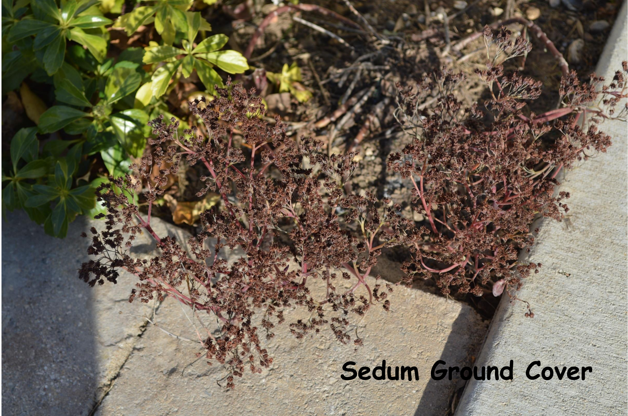
Sedum Ground Cover