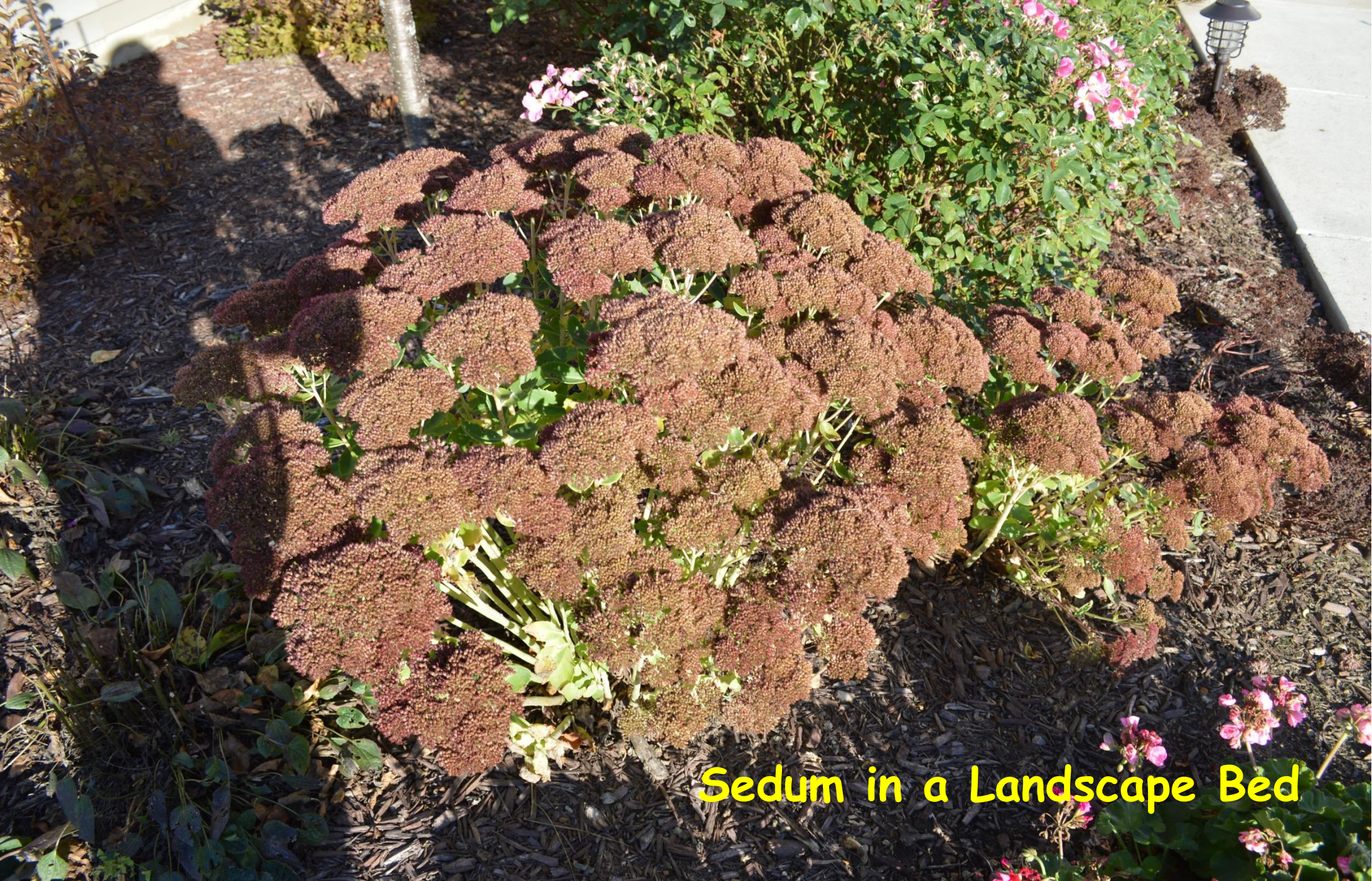
Sedum in a Landscape Bed